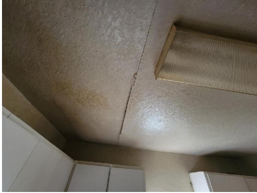
Interior Kitchen Drywall ceiling Visible water damage (cracking)