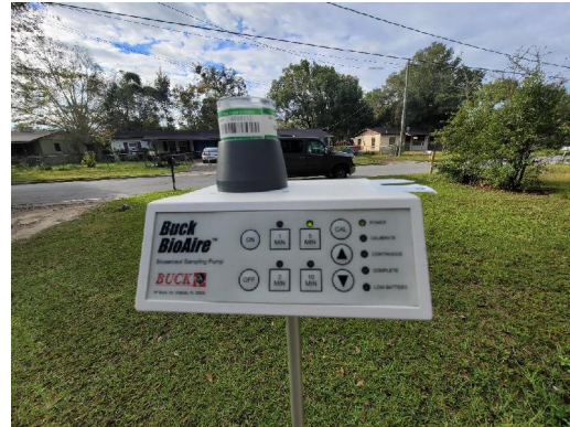
Pump B153637 Exterior South Wall sample