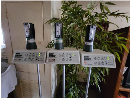
Pumps B153637, B153638, B154503 Calibration prior to testing