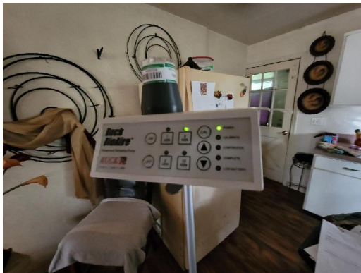
Pump B153638 Interior Kitchen sample