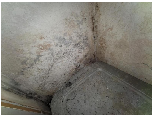
Interior Northwest Bedroom Closet Drywall walls, plastic storage bin Visible water damage Visible microbial growth