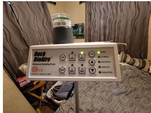
Pump B154503 Interior Northwest Bedroom sample