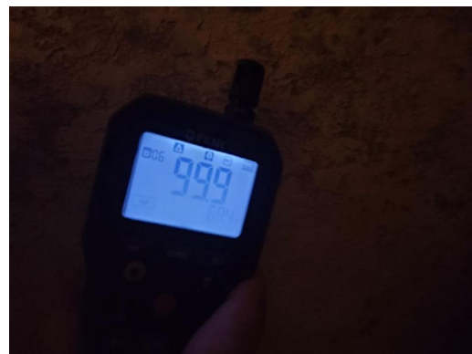
Interior Northwest Bedroom Closet Drywall wall Elevated moisture content (99.9%)